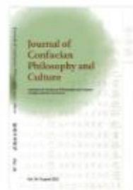
Vol. 38 (Feb. 2022)