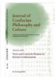
Vol. 36 (Feb. 2021)